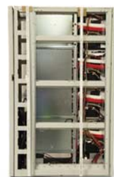
The ASCI Red supercomputer required 1,600 sq. ft. and was comprised of 85 cabinets, of which CHM has five in its permanent collection.

Remarkably, ASCI Red's service life was nearly 10 years, unheard of in the field of rapidly-obsolete supercomputers. It owed both its speed and longevity to a "massively-parallel" processing system, using over 9,000 standard Intel CPUs (Pentium Pro). This allowed it to break large calculations down into smaller ones for each CPU to work on—resulting in enormous speed. ○